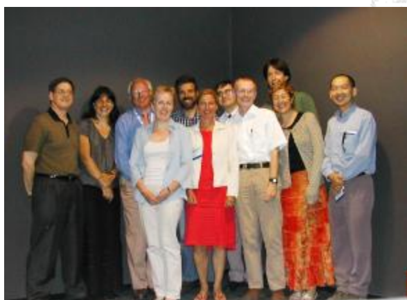
Members of the LCG

Last July, over the Lung Cancer Conference held in Barcelona, some of the authors, editors, peer-reviewers and members of the editorial office of the Lung Cancer Group (LCG) had the chance to meet and discuss some of the issues concerned with the running of the group.